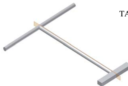
Figure 2 Quick Inspect Wrench

Salco Part # RD165PL2 Oseco 165 psi Ryton disc with teflon liner both sides, 3-1/8" OD