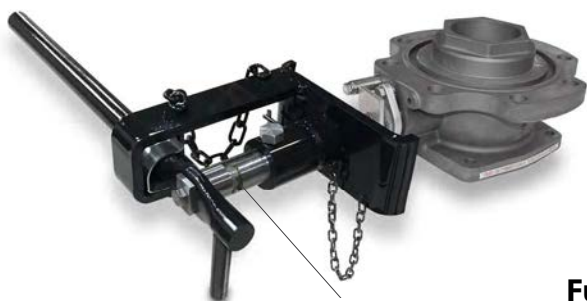
Compact Design (weld on)

Salco's Safeguard™ BOV Operating System design prevents unintended engagement with the valve to avoid accidental openings.