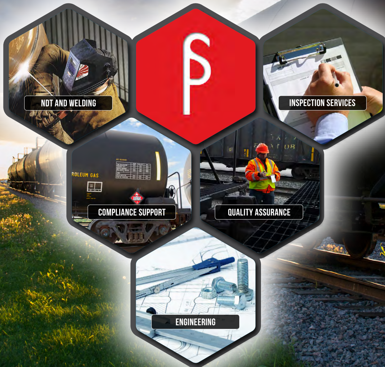
NDT AND WELDING

Providing professional and specialized services with over 35 years experience