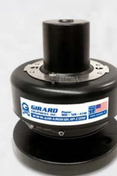
Pressure Relief Valves

*Rebuild kits available for both 2" and 3" valves