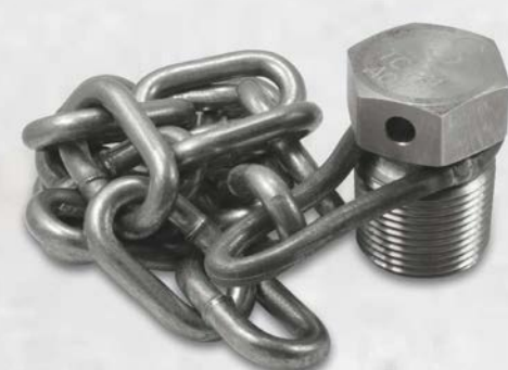
Plug & Chain Assemblies