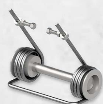
Manway Lift Assists