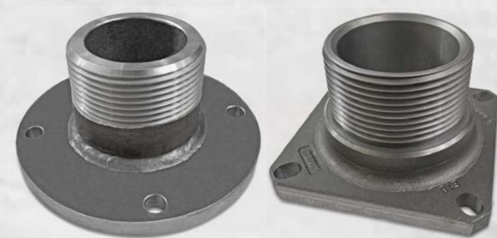
4-inch Bottom Outlet Nozzles