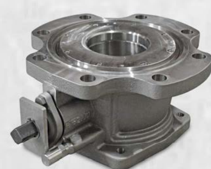
4-Inch Bottom Outlet Valves