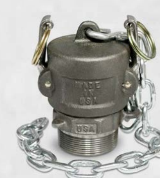
Top Loading Adapters