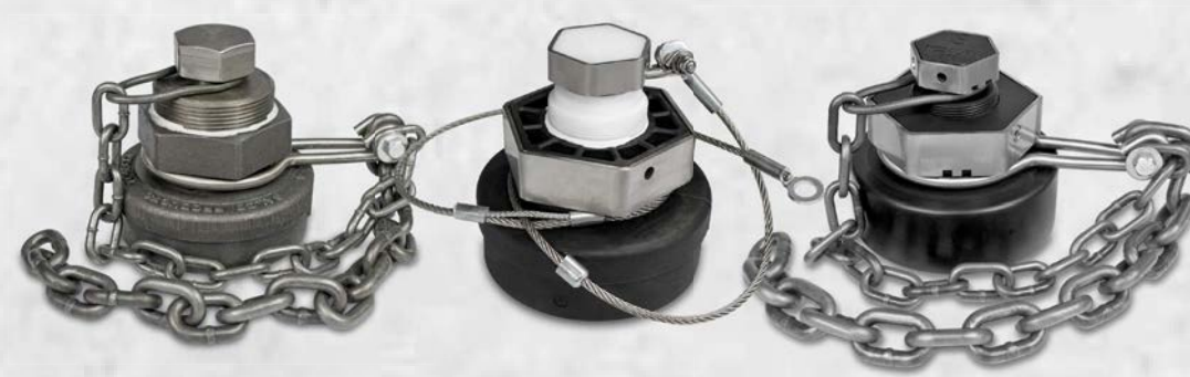
Bottom Outlet Caps