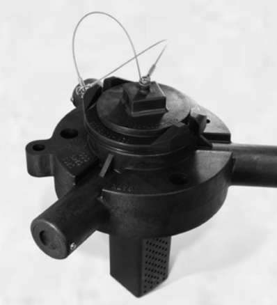
Quick Inspect Safety Vents