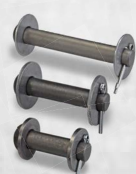
Button Head Rods