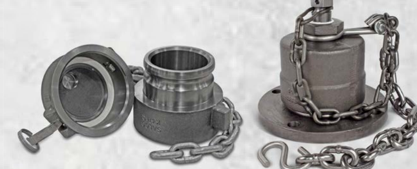
Bottom Unloading Adapters