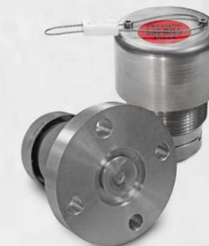
Vacuum Relief Valves