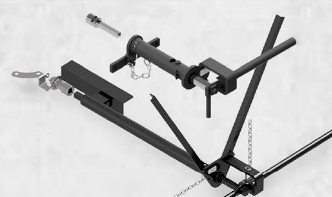
Bottom Outlet Valve Handles