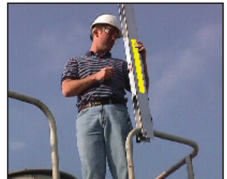
Part Number: HSG40AL01 - For Offset Hand Rails